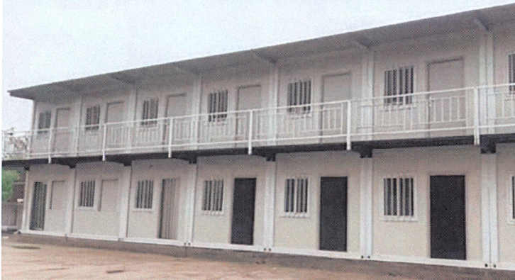
Artist rendering of the completed dormitory/classroom building for the Udon Thani Seminary.